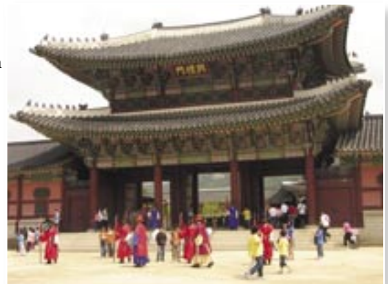
■ Korean Palace