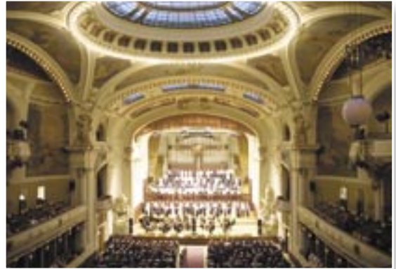
Rhapsody! Finale Concert at Smetana Hall, Prague