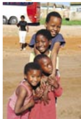
South African children

Given their commitment to a broad program of outreach in the communities they visit, The Yale Alumni Chorus found that South Africa proved to be a particularly exciting destination. 🍷