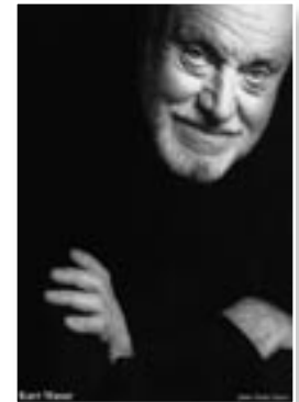
Kurt Masur, Principal Conductor

The ecstatic crowd at Royal Albert Hall cheered their well-wishes to the birthday boy who, in turn, treated his admirers to an encore in the form of Wagner’s Prelude to Die Meistersinger. Afterwards, the Maestro was honored by a reception at the French Embassy and awarded the medal of Grand Officier de la Légion d’Honneur. 🍷