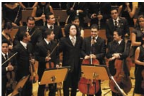
Gustavo Dudamel, Conductor

One of the biggest frenzies to occur in the realm of classical music news in 2007 was over the Simón Bolívar Youth Orchestra of Venezuela and its dynamic young conductor, Gustavo Dudamel . The amazingly talented ensemble made its first U.S. tour in November, and Classical Movements is elated to have played a role in helping these extraordinary young musicians bring their music, and their inspiration, to American audiences.