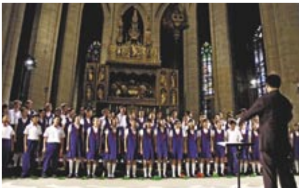
Hong Kong Children's Choir performing in Rhapsody! Festival