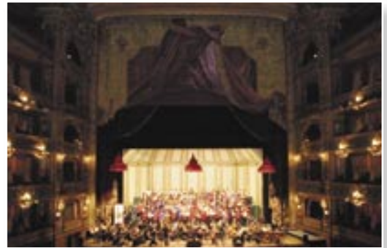
Teatro Colon Opera House

The 13-day festival includes joint rehearsals and performances as well as individual ensemble concerts, a South American music workshop; a day of cultural outreach and exchange spent singing, dancing and drumming with Brazilian samba school students and members of a local chorus from the infamous shantytown "City of God" and extraordinary sightseeing opportunities at Sugar Loaf, Corcovado and Copacabana Beach in Brazil as well as excursions in Buenos Aires to the colorful neighborhoods of La Boca and San Telmo, a tango evening at the Viejo Almacén, and a visit to a working estancia (Argentinean ranch). Past, present and future venues include Candelaria Cathedral in Rio,