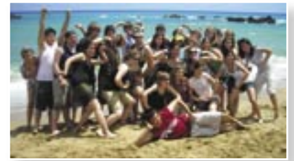
Portland Youth Philharmonic in Taiwan