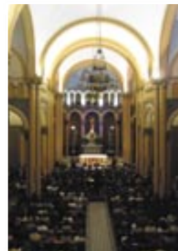
Concert at Ipanema Church

When not performing or rehearsing for their 6 concerts, the Yale Concert Band enjoyed visits to Christ the Redeemer Statue on Corcovado Mountain, Copacabana beach and to Sugar Loaf Mountain to watch the sun set. 🍷