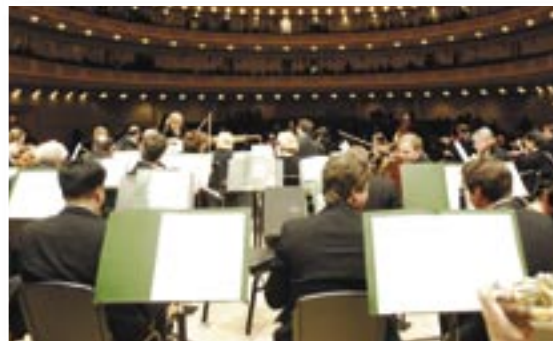
The Minnesota Orchestra at Carnegie Hall