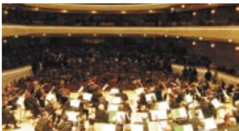
Philadelphia Orchestra in Henry And Renee Segestrom Hall in Orange County, California

backstage at the Walt Disney Concert Hall in Los Angeles, commemorating her 25 years of service as the Orchestra's principle travel manager on the road.