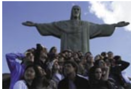
Yale Concert Band at Christ the Redeemer Statue in Brazil