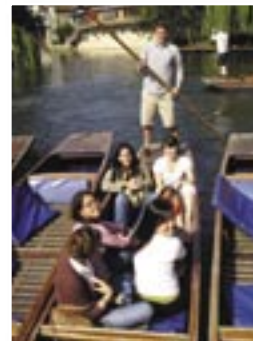
Punting on the River Cam

The tour concluded with 3 days in Wales where The University of Maryland Chamber Singers represented the United States at the Llangollen International Musical Eisteddfod. The Llangollen International Musical Eisteddfod is a world-renowned festival of music, song and dance. The Chamber Singers performed brilliantly and took home the 2 nd Place prize in the Mixed Choir category. 🍷