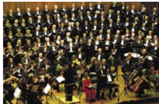
The Yale Alumni Chorus at Linder Auditorium

with 3 other choirs in a celebratory performance sponsored by General Motors , to benefit Ubuntu Educational Fund at Feather Market Centre in Port Elizabeth. The Yale Alumni Chorus' final concert was performed with Simon Estes and the Simon Estes Music High School choir to benefit the high school at Artscape Opera