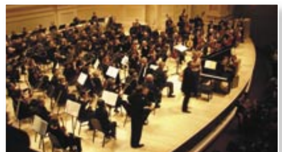
St. Louis Symphony Orchestra at Carnegie Hall