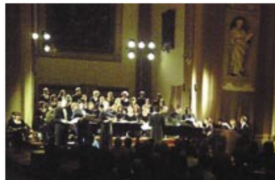
Smith College Chamber Singers performing in Bologna

The trip’s primary purpose, of course, was the music, and Italian audiences were in for a treat. The Yale Glee Club was fortunate to be able to collaborate with a number of local university choirs. And, like a number of other very accomplished choruses that have traveled with Classical Movements, The Yale Glee Club