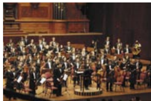
Portland Youth Philharmonic in Taipei

The orchestra received "rock star" treatment by enthusiastic audiences and enjoyed joint performance opportunities with two of South Korea's gifted youth orchestras. 🍷