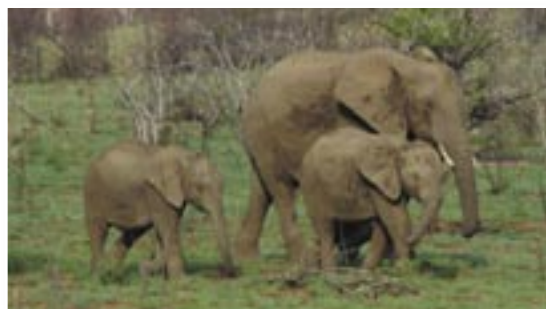
Pilanesberg Game Reserve, Game Drive

ship, fostering life-long friendships that reach around the world. Visit www.ClassicalMovements.com to learn how your choir can be a part of this very special and memorable event. Mark your calendars for the 2010 IHLOMBE South African Choral Festival taking place July 28 - August 9, 2010. 🐘