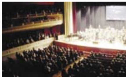
Yale Concert Band at Santos Teatro Coliseu

The performing itinerary included an appearance at the Centro de Convivencia Cultural in Campinas, the prestigious Cultura Artistica in Sao Paulo, the famous Sala Cecilia Meireles Concert Hall , the Nossa Senhora da Paz Church in Ipanema, Santos Teatro Coliseu and Teatro Sesi in Sorocaba.