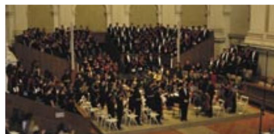
Yale Glee Club with the University of Bologna Choir

Classical Movements has extensive experience managing concert tours in Italy and is well-acquainted with performance travel throughout Northern and Southern Italy as well as Sicily. 🇮🇹