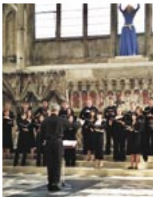
University of Maryland Chamber Singers at Ely Cathedral

The Chamber Singers held three concerts at major English venues such as Ely Cathedral and Hampton Court Palace as well as a joint concert with the Wessex Male Choir at the Church of the Holy Rood. The choir performed works by Brahms, Dering, Penderecki, Poulenc and Hogan.