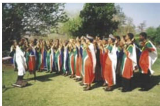
Soweto Imilonji ka Ntu Choir

Classical Movements, in association with The Choral Institute of South Africa – CHORISA, is pleased to announce a brand new addition to its list of international music festival offerings – the IHLOMBE South African Choral Festival . The inaugural IHLOMBE Festival, takes place July 8-20, 2009 at dynamic venues in Cape Town, Johannesburg, Pretoria, Soweto and Stellenbosch, South Africa, will include at