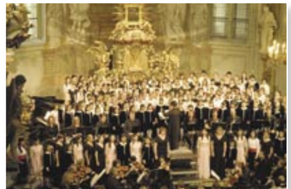
Rhapsody! Concert at St. Simon and Judah Hall, Prague