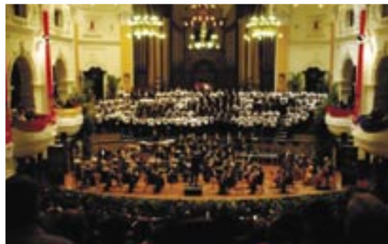
Cape Town City Hall

Choirs from Canada, China, England, Georgia, Germany, Israel, Kenya, Latvia, Lithuania, New Zealand, South Africa, Swaziland, Tanzania, the United States and Venezuela plan to join coming festivals.