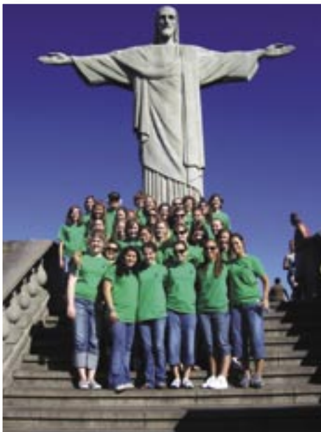
The Minnetonka Chamber Choir in Rio