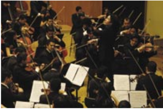
Simon Bolivar Youth Orchestra of Venezuela, directed by Gustavo Dudamel

Sir Simon Rattle and composer John Williams. To say that the concerts were received by audiences and critics alike with enthusiastic acclaim would be a gross understatement.