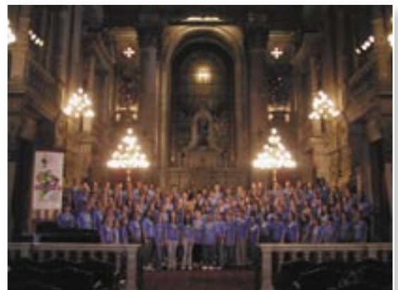
Melodia! Participants in Candelaria Church in Rio

Choir participants in Melodia! include The Children's Chorus of Sussex County , The Children's Chorus of Washington , The Choir of Groton School , The Miami Children's Chorus , The Minnetonka Chamber Choir , Cidade de Deus Children's Choir (Brazil) , Coro Vocal del Sur (Argentina) , Niños Cantores de Cordoba (Argentina) , Niños Cantores de Lara (Venezuela) , Coro Voces del Mañana (Cuba) , The New Zealand Secondary Students' Choir (New Zealand) , The Oakville Children's Choir (Canada) and The Winnipeg Mennonite Children's Choir (Canada) . 🍷