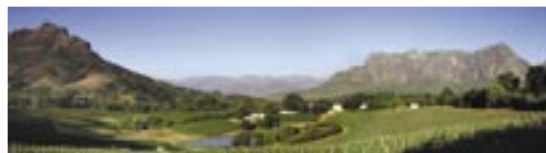
Stellenbosch Wine, Cape Town

The festival is open to talented adult and children's choirs from around the world, opening the door to occasions of incredible music-making, plus the opportunity for valuable international cultural and interpersonal fellow-