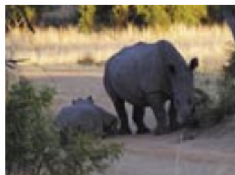
South African Rhinoceros