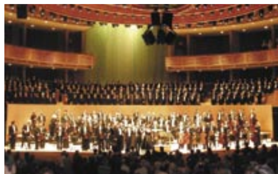
Atlanta Symphony Orchestra and Chorus at ACDA Convention in Miami