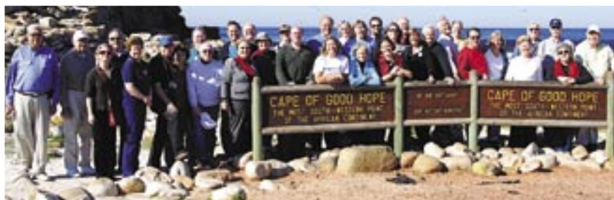
The Yale Alumni Chorus at the Cape of Good Hope

The Yale Alumni Chorus Donated Over $43,500, a Sound System and 110 Instruments to Towns in South Africa