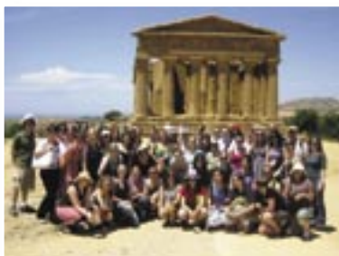
Smith College Chamber Singers in Sicily

“Italy continues to be a favorite musical tour destination”