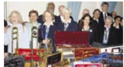
Yale Alumni Chorus with instruments donated to the Eastern Cape Philharmonic Orchestra