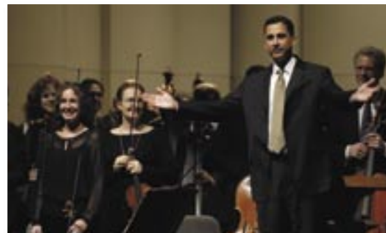
Emil de Cou and the National Symphony Orchestra

By allowing Classical Movements' experts to manage the multitude of complex logistics involved in performance travel, the NSO musicians were free to focus on their music performance and on their personal interaction with the individuals and students they encountered along the way. Classical Movements applauds The National Symphony Orchestra on a successful tour, and more importantly, on a most successful program. 🍷