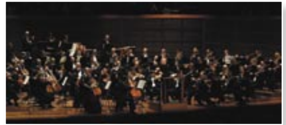
Christoph Eschenbach with Philadelphia Orchestra in San Francisco