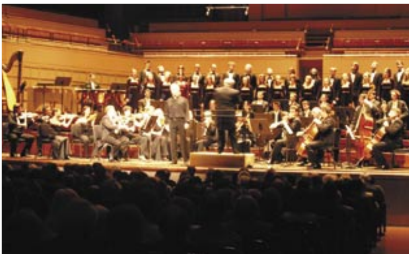
Dmitri Hvorostovsky with the Moscow Chamber Orchestra and the Moscow Academy of Choral Art

Classical Movements is distinguished as the only touring company to specialize in musical travel for both professional orchestral and choral ensembles, making possible several extraordinary and remarkable choral and orchestral collaborations.